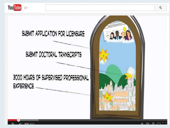
"How to Become a Licensed Psychologist" YouTube video

In order to further demystify the licensing process, as well as other aspects of the Board's functions, Board meetings are held at educational institutions that provide graduate training in psychology. Students, faculty, and others interested in learning about what the Board does are invited to attend, to ask questions about our process, and to participate as different topics are discussed. We reserve time during each meeting for students and faculty to get answers to their questions about licensure, the exam process, or any other issues. The first meeting was held in February in Sacramento at the Alliant campus, and in May the Board met at Pepperdine's Los Angeles campus. To see the dates and locations of future Board meetings, go to our website, www.psychology.ca.gov, and click on "Board Meetings"