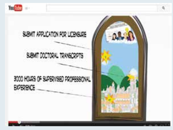
"How to Become a Licensed Psychologist" YouTube video

In order to further demystify the licensing process, as well as other aspects of the Board's functions, Board meetings are held at educational institutions that provide graduate training in psychology. Students, faculty, and others interested in learning about what the Board does are invited to attend, to ask questions about our process, and to participate as different topics are discussed. We reserve time during each meeting for students and faculty to get answers to their questions about licensure, the exam process, or any other issues. The first meeting was held in February in Sacramento at the Alliant campus, and in May the Board met at Pepperdine's Los Angeles campus. To see the dates and locations of future Board meetings, go to our website, www.psychology.ca.gov, and click on "Board Meetings"